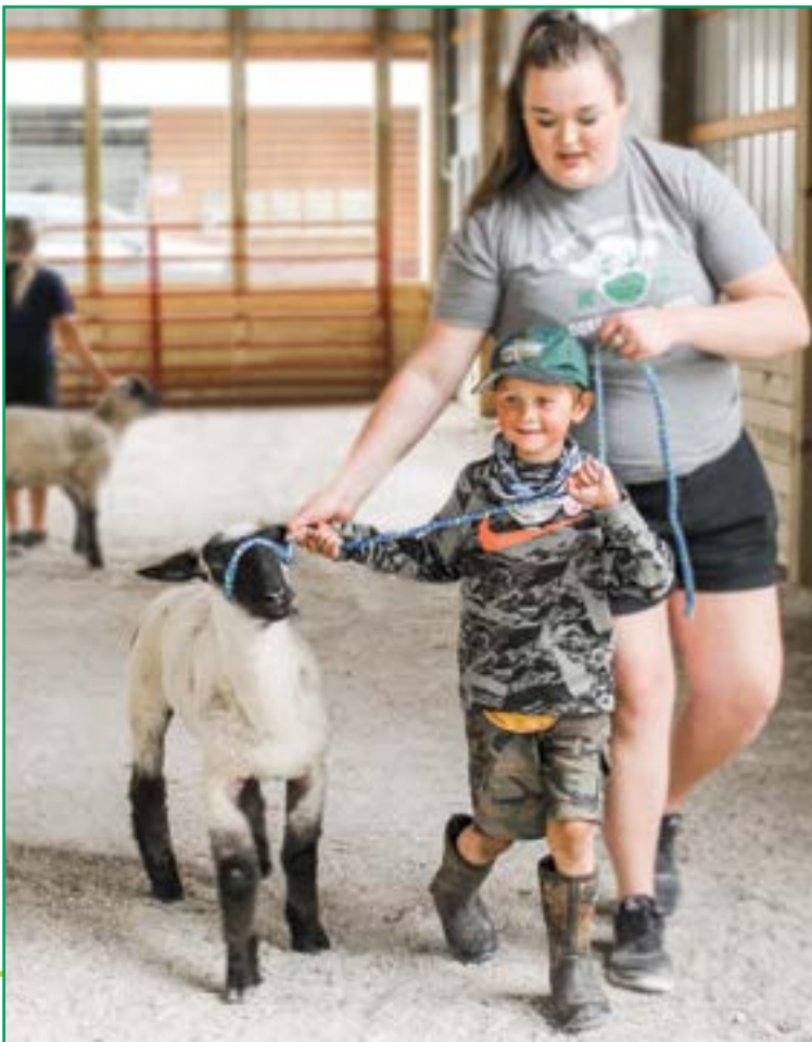
Below: Mini-4-Hers and Jr. Leaders participate in a Mini Showmanship Workshop in Washington County.