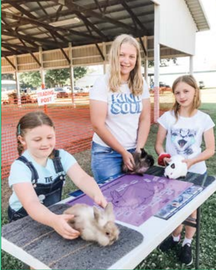
Morgan County 4-H Rabbit Club members working with the parts poster from a livestock learning kit purchased with Premier Companies grant funds.