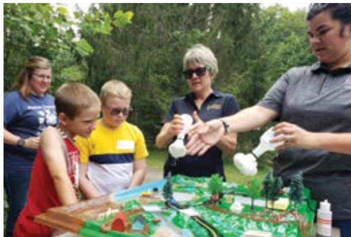
Your donations enable the Indiana 4-H Foundation to continue providing enriching educational opportunities for youth across the state.

"We're not big donors, but we truly believe in 4-H. It's very dear to our hearts. Giving monthly with our credit card is an easy way to give back."