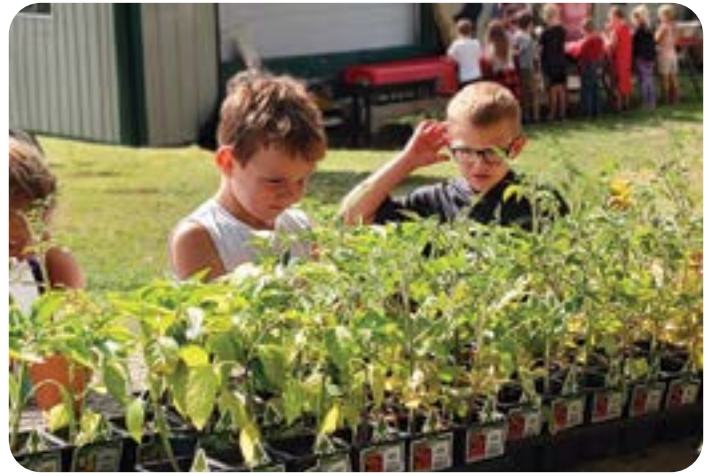
Above and below: Local daycare groups spent a day learning about where their food comes from, thanks to a YES Grant.