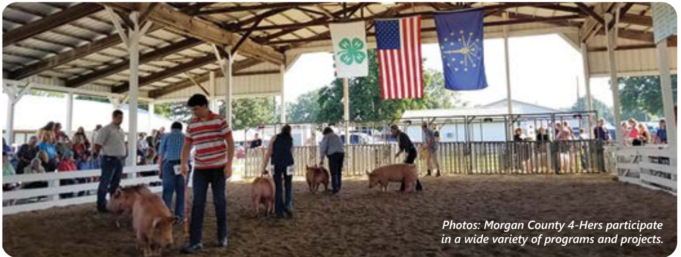
Photos: Morgan County 4-Hers participate in a wide variety of programs and projects.