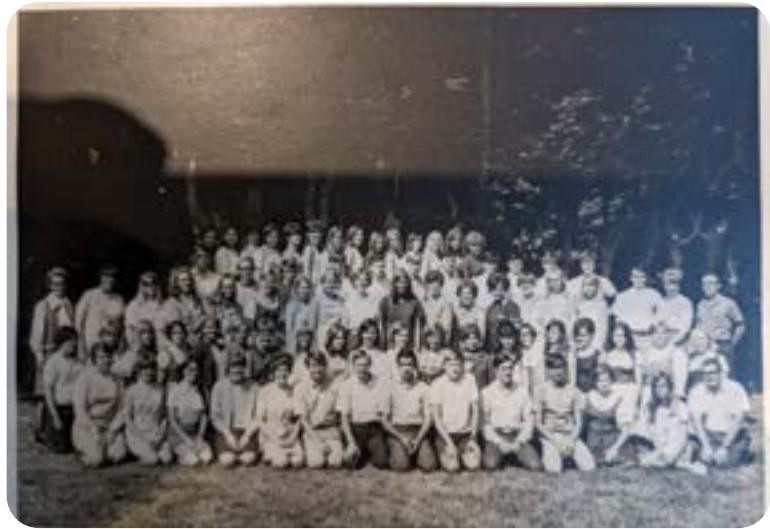
Above: 4-Hers from across the United States participated in an exchange program called Teen Caravan in 1969.