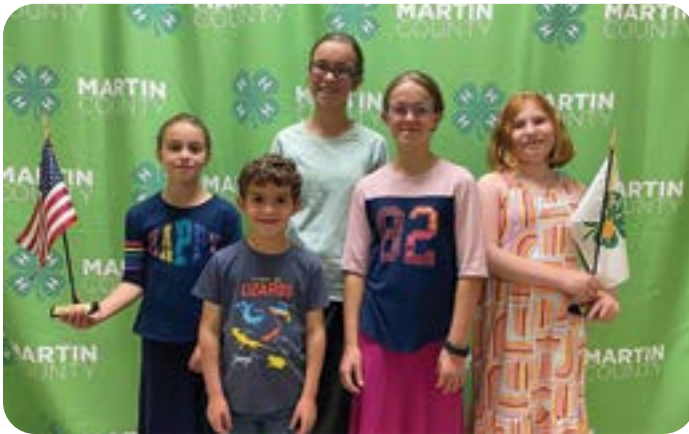
Above: Martin County 4-H