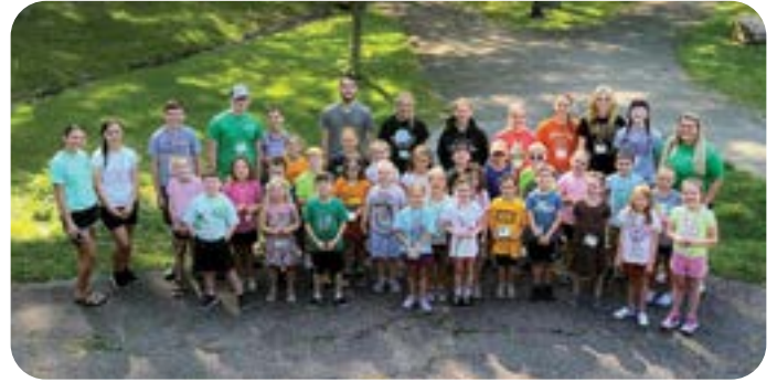
Your gifts help support Indiana youth!

For a complete list of Foundation donors, visit in4h.org/2023-donor-honor-roll .