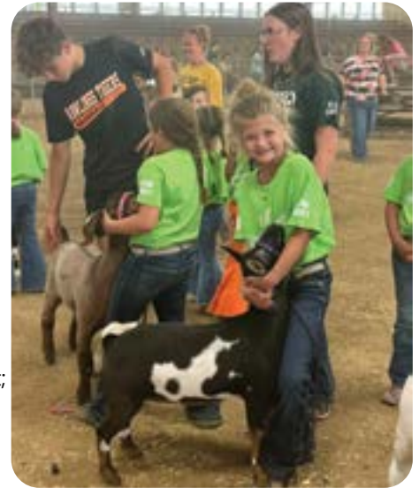
Above: Clark County 4-Hers are proud to partner with Premier Companies.