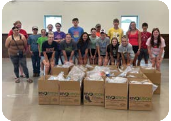
Above: Marshall County Junior Leaders used YES Grant funding to assemble and distribute 367 Comfort Care Kits to food banks and pantries.