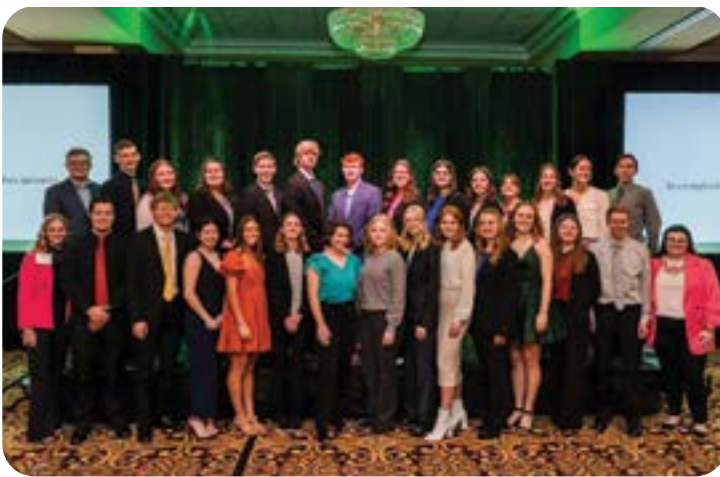
Above: 2023 scholarship recipients

Swartz Family Community Mortuary & Memorial Center