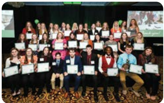
2025 Accomplishment Scholarship Recipients

Keep an eye out for more details in an upcoming e-news!