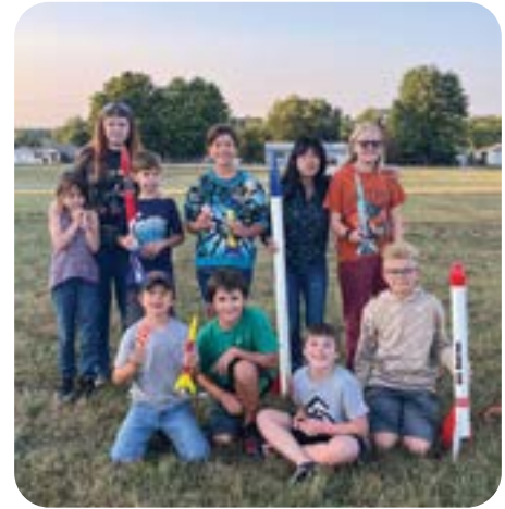
Above: Owen County 4-Hers